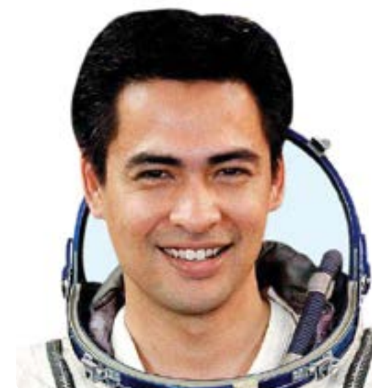
Dato Dr. Sheikh Muszaphar Malaysia's First Astronaut