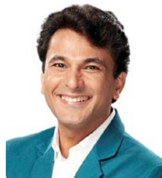
Vikas Khanna Michelin Star Chef