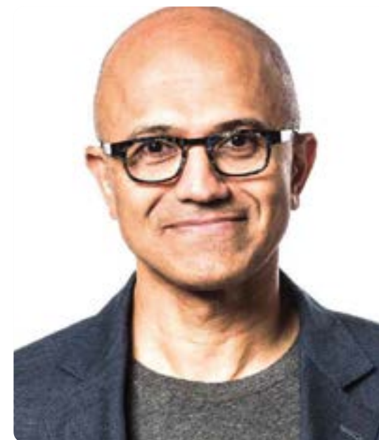
Satya Nadella CEO Microsoft Corporation